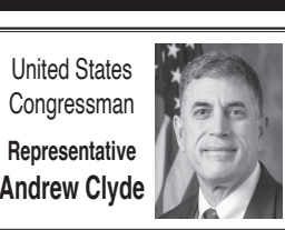
United States Congressman Representative Andrew Clyde

On March 30, our nation was abruptly submerged into uncharted waters as Donald Trump became the first former President in U.S. history to be indicted.